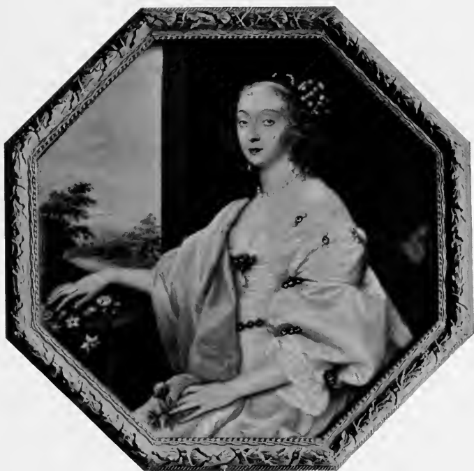
MARY, DUCHESS OF RICHMOND AND LENOX (1623-1685) BY JEAN PETITOT THE ELDER (1643)